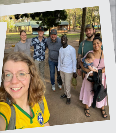
Serving the Nations