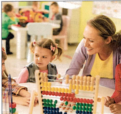
5. A child-care worker can _____.