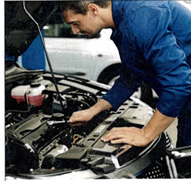
6. An auto mechanic can _____.