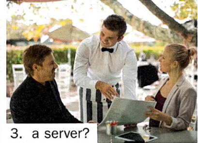
3. a server?