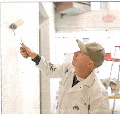
1. A painter can paint .

build things fix cars paint sell things take care of children take care of plants