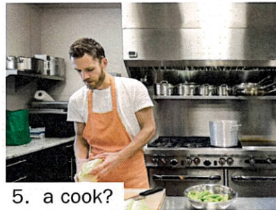
5. a cook?