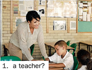
1. a teacher?