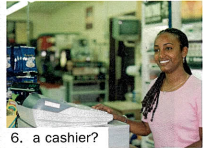
6. a cashier?