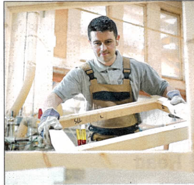
3. A carpenter can _____.