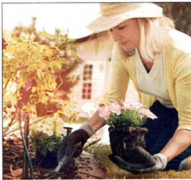
4. A gardener can _____.