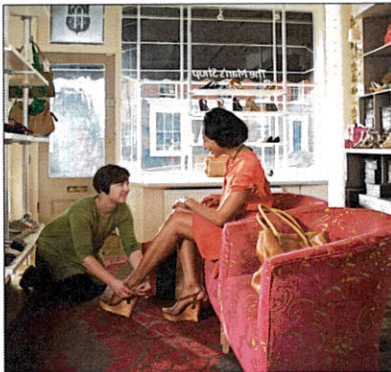
2. A salesperson can _____.